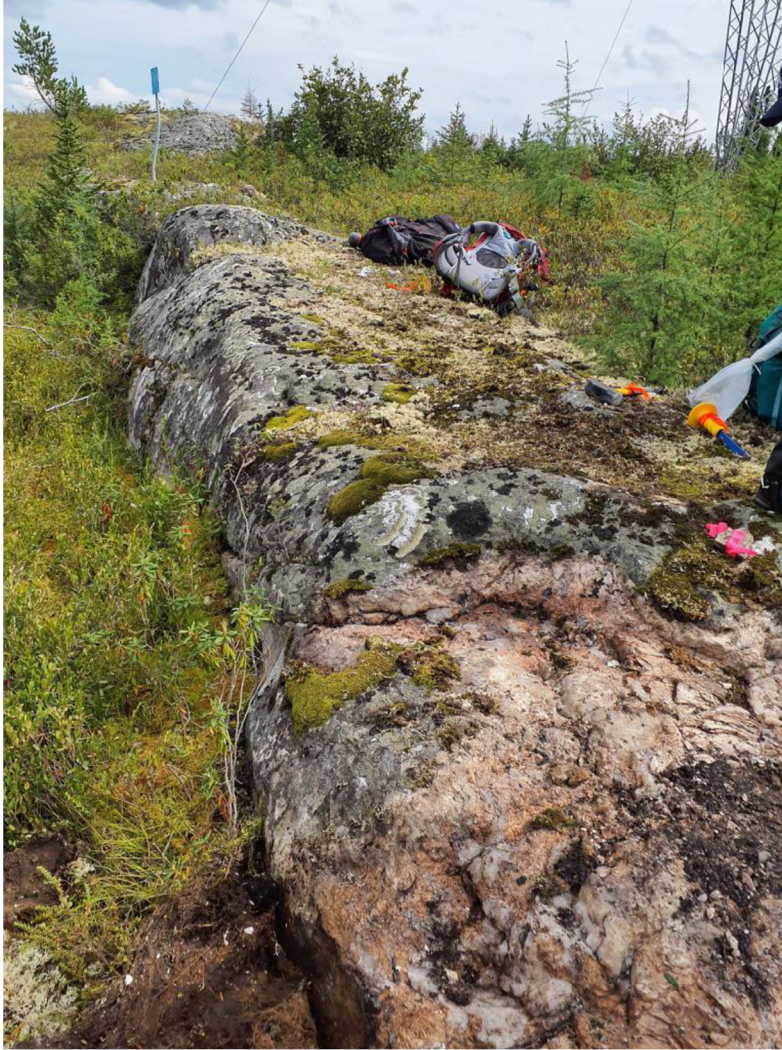
Figure 2. Recently mapped pegmatite outcrop at the Highway Lithium Property.

The Company also announces that, further to its news release of August 10, 2023, it has closed the transaction whereby it acquired a 100% interest in the Alice lithium property located in the Red Lake Mining Division of Northern Ontario. The Company paid $100,000 and issued 1,000,000 common shares to the vendor. The Alice Property is subject to a 2% net smelter returns royalty in favor of the vendor, one-half of which can be purchased by the Company at any time for a cash payment of $1,000,000.